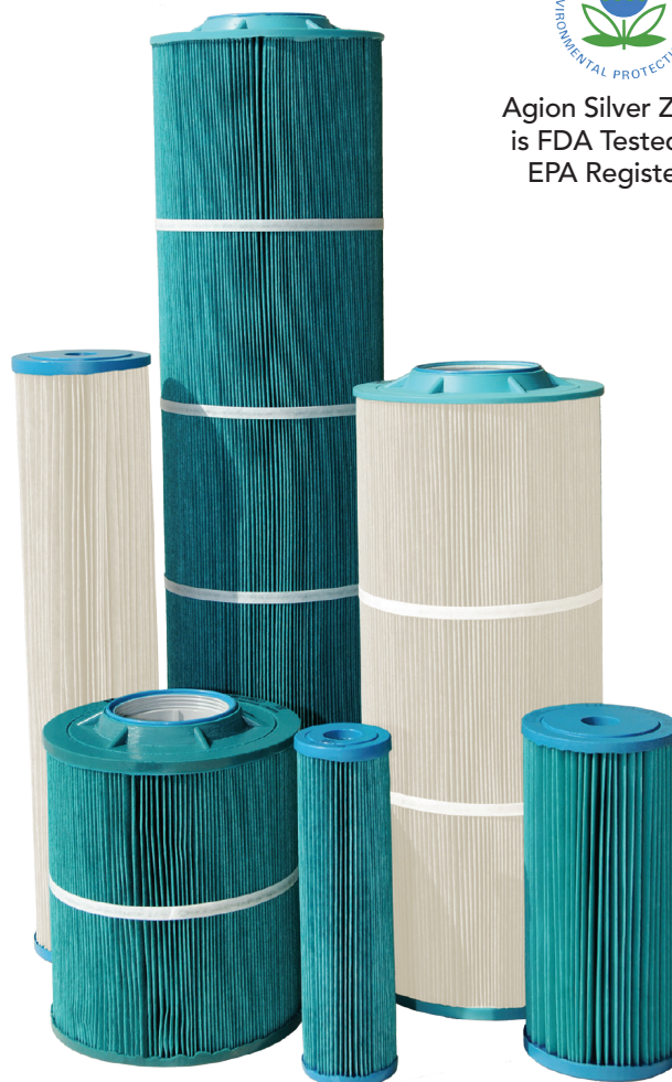
Media color may be either green or white

Agion Silver Zeolite is FDA Tested and EPA Registered