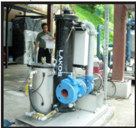
The resort's new LAKOS TCX-100-SRV during installation

With the hotel's cooling towers and mechanical room only 50 feet from the beach, keeping solids out is a high priority for this exotic ocean side resort. So when their chiller's condenser and cooling tower's basin filled with sand, pieces of plastic, wood sticks and other debris, the 5 star resort acted quickly.