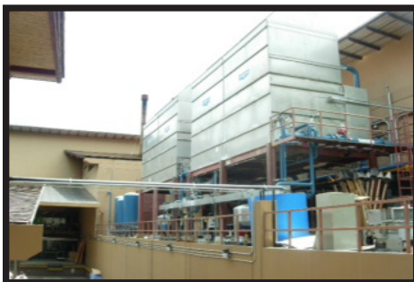
The hotel's cooling towers are only 50 feet away from the beach, making solids-free water a top concern

Problem: The Four Seasons Hotel and Resort at Peninsula Papagayo in Costa Rica is a tropical getaway. Situated perfectly in the middle of lush foliage and relaxing beaches, guests of the resort are surrounded by beauty and luxury. The customer experience is the number one priority.